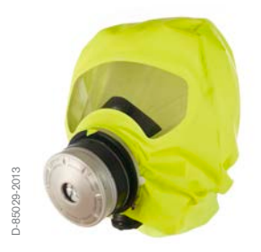
Dräger PARAT<sup>®</sup> 5500 Escape hood

Replacing the filter after 8 years will extend the service life of the Dräger PARAT Escape Hood to 16 years in total. For this, Dräger offers filter replacement service or an expert training for your employees. In the long term, this offers you great cost savings.